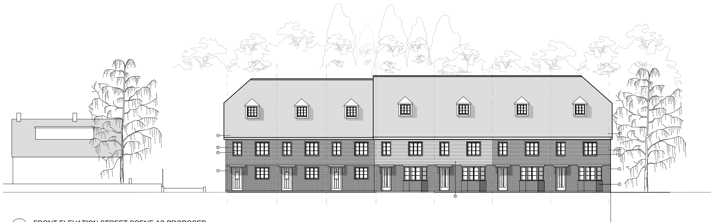
1 FRONT ELEVATION STREET SCENE AS PROPOSED SCALE 1:200 @ A3